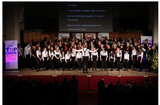
Top Choir Kent Gala Concert – April 2015 Finale with all 7 choirs singing the Beatles' "Help"