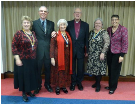
Special Guest Night to celebrate 90 th Birthday of the Canterbury Inner Wheel – March 2015