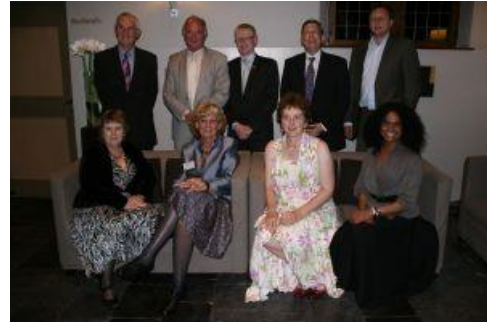
The 5 Pentangular Presidents with Spouses at Leuven – May 2015