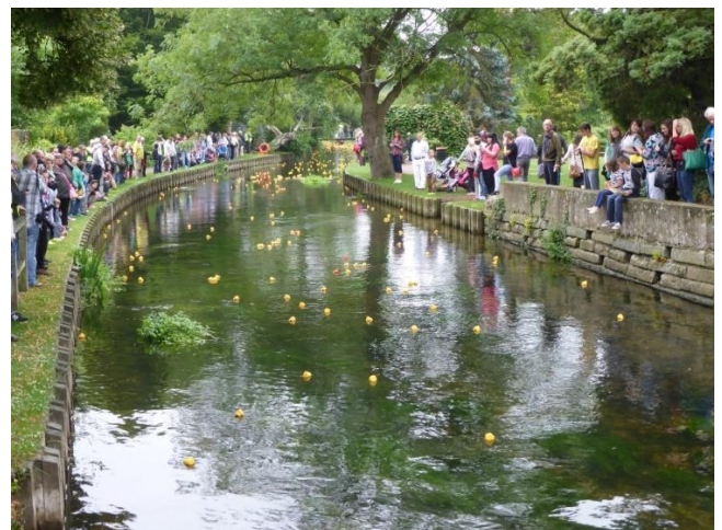
Crowds at Duck Race in Westgate Gardens – July 2014