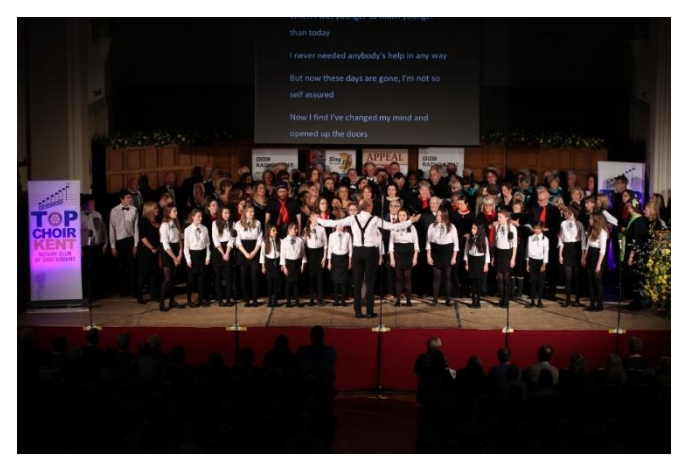
Top Choir Kent Gala Concert – April 2015 Finale with all 7 choirs singing the Beatles' "Help"

Special Guest Night to celebrate 90<sup>th</sup> Birthday of the Canterbury Inner Wheel – March 2015