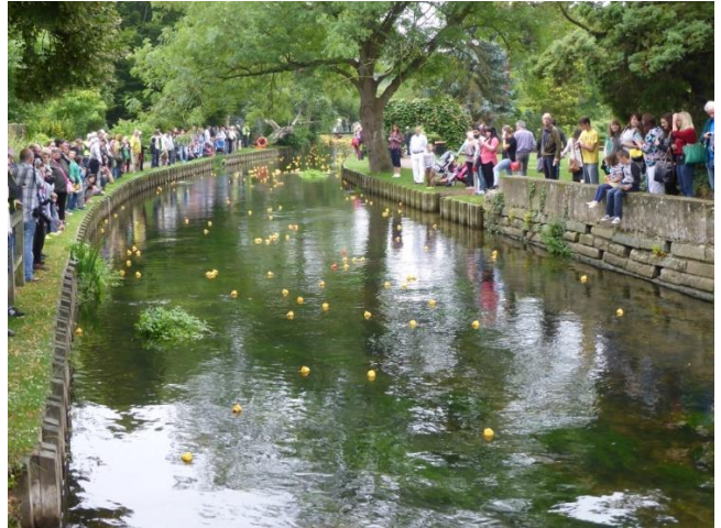
Crowds at Duck Race in Westgate Gardens – July 2014